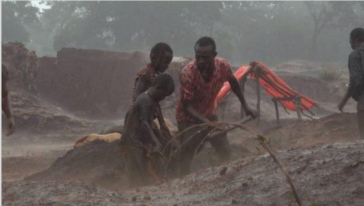
Child labor and "warzone"